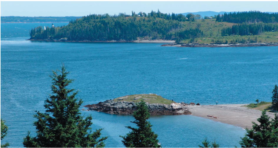
View from the summit of Butter Island